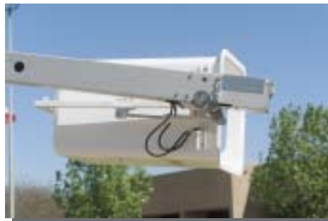
Hydraulic leveling allows for simplified clean out.

TIME MANUFACTURING COMPANY P. O. Box 20368 Waco, TX 76702-0368 Tel.: 254-399-2100 Fax: 254-399-2651 www.timemfg.com