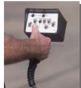
Remote electric control allows operation from the ground.