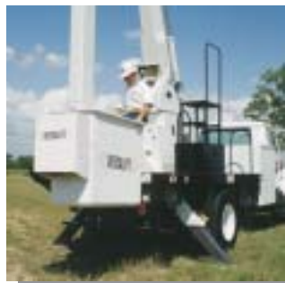
Easy bucket access.