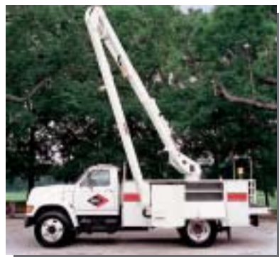
Articulation allows for easy accessibility.