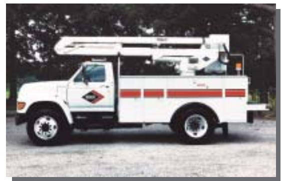
Compact travel height in stowed position.