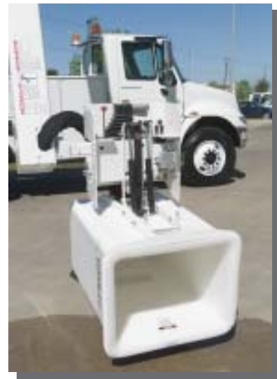
Platform tilt allows for easy cleaning.