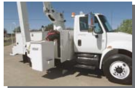
Articulation allows for easy access to compartments.