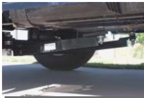
Torsion bars provide additional chassis support.